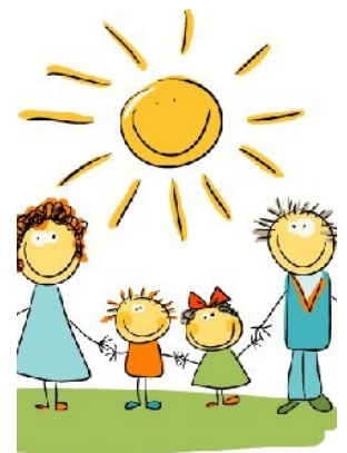
Families as the first teachers.